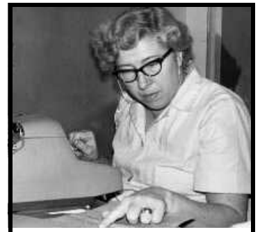
Madalyn Murray O'Hair Born - 1919 Founded American Atheists Murdered by member - 1995

dom, it is continually reported by the news media that a Nativity scene or a Ten Commandment display has been ordered by some court to be removed from public property. From the year 1635 to 1963, all public schools opened class with a prayer and Bible reading. Yet Constituwithout any tional amendment, in the case of Murray v. Curlwett - a suit brought by