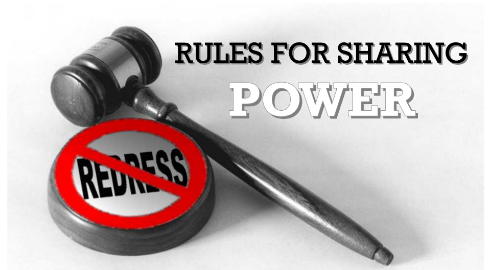
"The judicial Power shall extend to all Cases, in Law and Equity, arising under this Constitution, ..." Article III, Section 2. Some may imagine federal courts are eager to rule in constitutional controversies. But in this series, we explore several ways in which federal courts, to the detriment of liberty and justice, often avoid making any decisions at all.