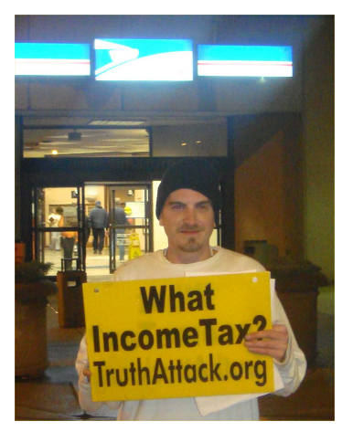
A T-Trooper displays his sign at the Baltimore post office. Several T-Troopers braved the cold, rainy night to hand out nearly 800 OST flyers over seven hours.

"Next year's [event] will be even bigger and better and maybe," says Cryer, "just maybe, we won't need one for the year following."