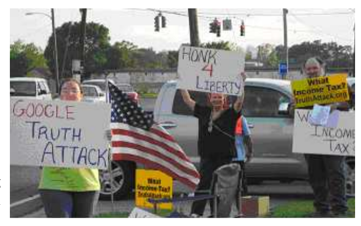
T-Troopers display signs and hand out flyers at the main post office in Shreveport, La. This group handed out nearly 2,000 OST flyers.

Operation Stop Thief groups have been reporting to Truth Attack that flyers questioning the income tax were handed out at over 1,200 post offices across the nation this year, delivering the truth to over a million last-minute tax return filers.