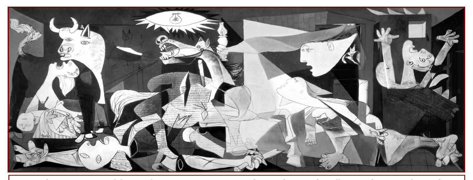
Guernica, by Picasso, is one of the most famous anti-war paintings in history, depicting the suffering and ravages of war. The mural was in response to Nazi Germany and Italy's bombing and machine-gun strafing of the inhabitants of a Basque village on market day. They murdered the people for (later Dictator) Franco during the Spanish Civil War, which lasted from 1936 to 1939.