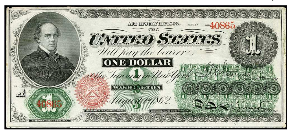
Image of a one-dollar "greenback," authorized by the "Act of July 11th, 1862" (12 Stat. 532, Ch. 142) and issued August 1st, 1862. This is a bill of credit issued by the federal government, and is illegal under the Constitution of the United States.