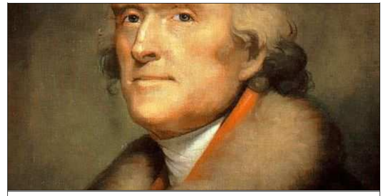
Thomas Jefferson. From a painting attributed to Rembrandt Peale, 1805.

that the Hamiltonian example is rather weak, and therefore, supported by the Jeffersonian explanation that is pre-Constitutional Convention, before the abolishment of paper money. Surely the conformity of the public offices and the courts would be surplus if the States and Congress were both issuing bills of credit and both foreign and domestic coins were in circulation. But when the law only permits the tender of gold and silver coins, then, and in that case, the conformity of the public offices and the courts is a very meaningful provision.